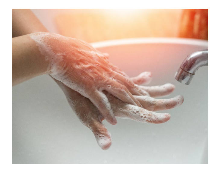
Cleaning Your Hands