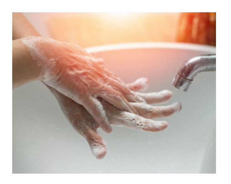
Using soap and running water