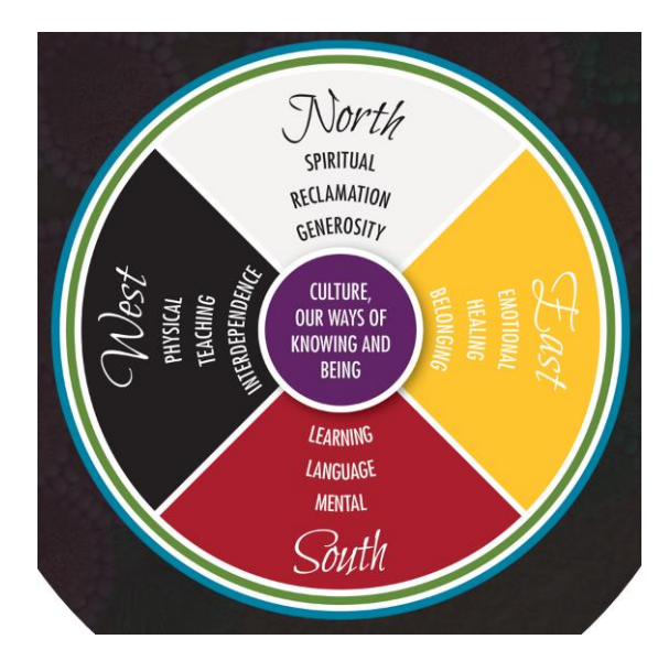
Figure 3. Model of Wholistic Health and Wellbeing<sup>33</sup>

"The medicine wheel is a tool used by many First Nations as a way to understand the world around us. The wheel includes teachings about the four directions, the seasons, the stages of life, races of people, and on and on. Today, I'm going to be focusing on the main quadrants of the mind, the body, the spirit, and the emotion."