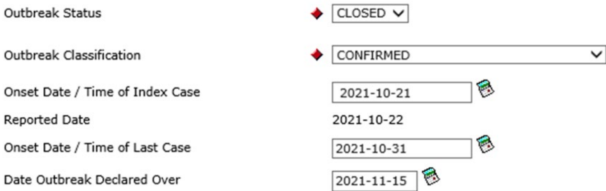
Figure 3. Screenshot of select outbreak description fields for entering onset dates and date outbreak declared over in iPHIS