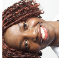
Health Care Provider's Supervisor